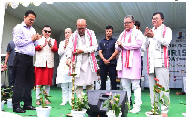
IT News Imphal, Sept 27:

Chief Minister N. Biren Singh said that the State's future lies in the tourism sector and so the State Government has been putting in every effort to bring positive change in the State.